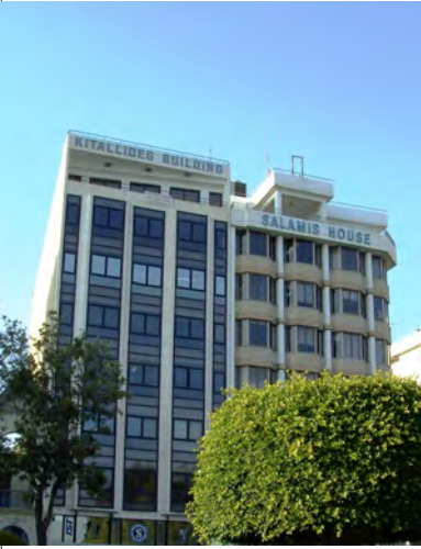
Our office in Cyprus (left)